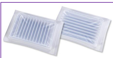
Single wrapped packaging