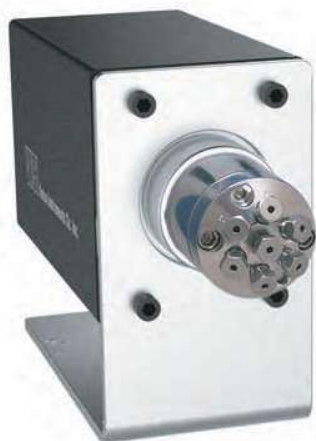
6 POSITION SELECTOR 1/16" stainless Valco fittings